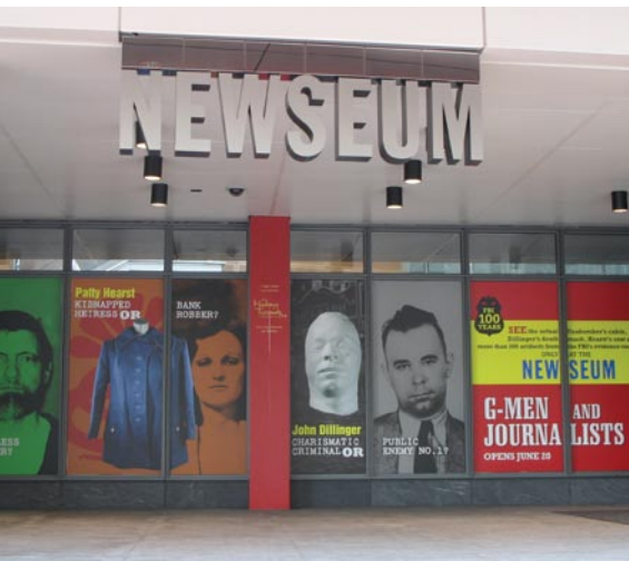
At top, the dome of the U.S. Capitol building at sunset. At bottom, the entrance to the Newseum, an interactive museum dedicated to journalism that takes visitors behind the scenes into how news is made.

Roosevelt Memorial. Located along the Tidal Basin, the memorial is dedicated to the thirty-second president, and the only one who used a wheelchair. It traces the 12 years of FDR's presidency through a series of waterfalls and scenes depicting each of his four terms in office. The memorial includes an area of tactile reliefs with Braille writing.