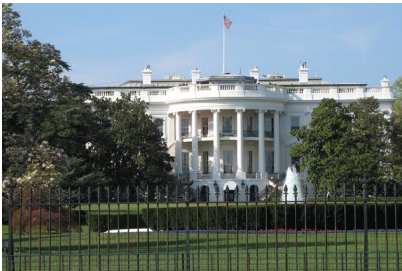
The south façade of the White House.